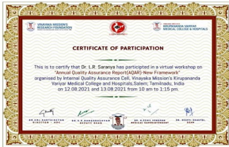
Screen shots of program with participants, guest speakers and awarded certificates.

Seeragapadi, Salem-636 308. Tamilnadu, India